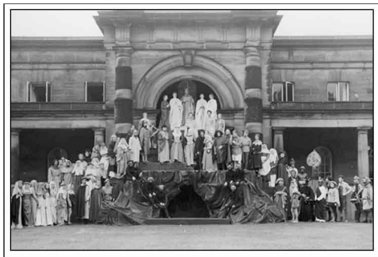
Full cast of the Wakefield Mystery Plays - 1958

"... How well, too, did Adam and Eve portray the wonder of life and the fall into human sin..."