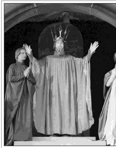
Michael Jackson (God)