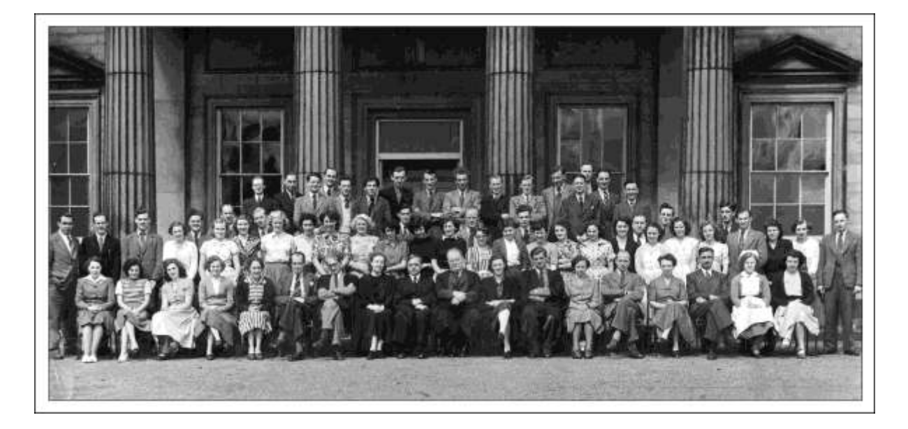
Bretton Hall Staff and Students - 1950

Photos of people arrayed in serried ranks like those above adorn most academic institutions and lie in the backs of alumni's drawers, hidden from the light for many years. They also occasionally appear in local newspapers, optimistically labelled: "Where are they now?" This one perhaps, is different – firstly, the photograph was taken more than sixty years ago, less than a year after Bretton Hall opened its doors to students and staff in 1949. Secondly, in 1999, twenty-two survivors of the above pioneers reassembled at Bretton Hall for a Reunion.